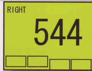
Screen view during measurement